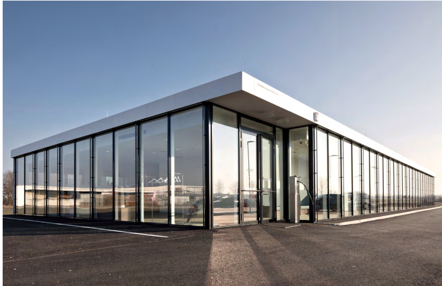
Institute for CT MRI, 2230 Gänserndorf

We plan and deliver operating rooms, laboratories and entire clinic buildings on a turnkey basis.