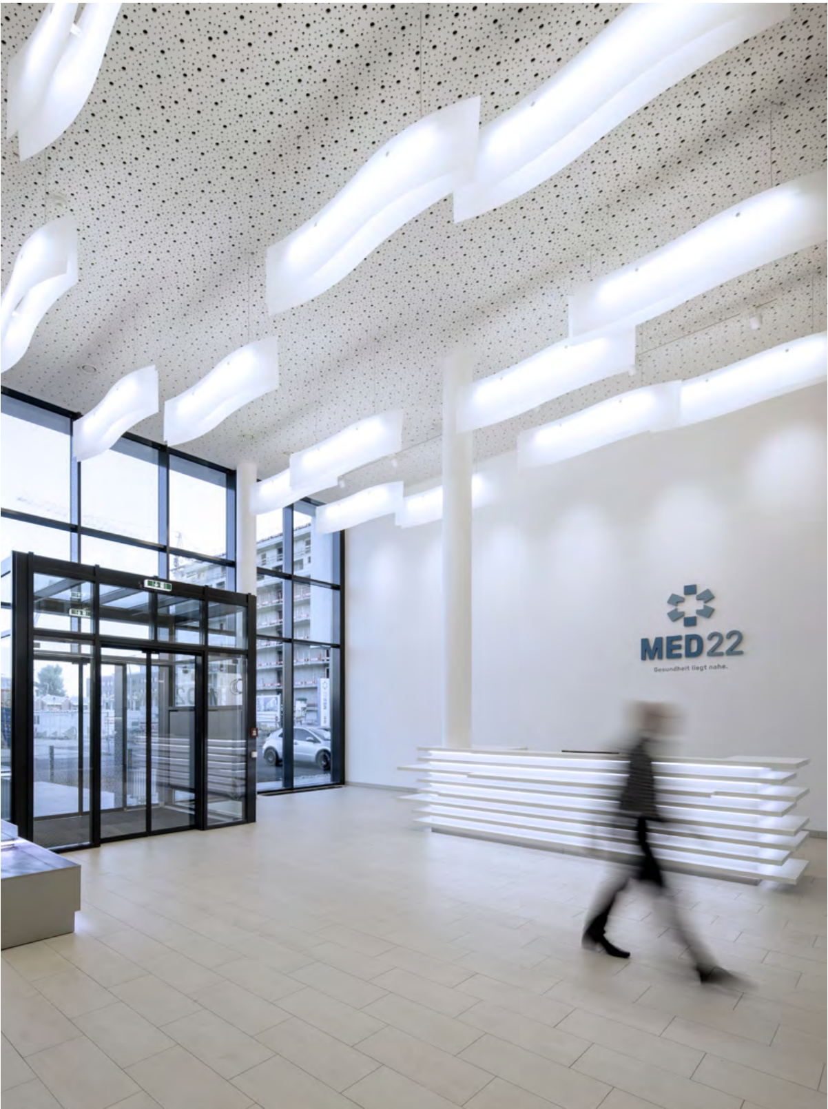
MED22, 1220 Vienna