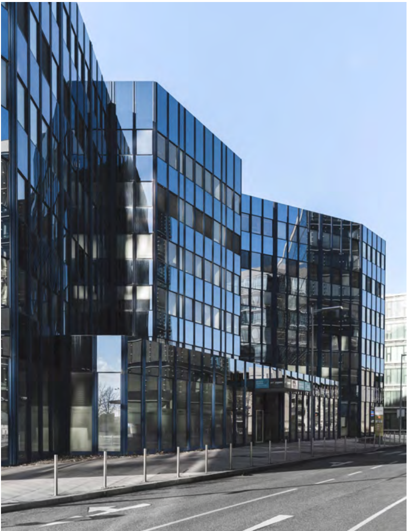
Health Center Vienna Airport, 1300 Schwechat