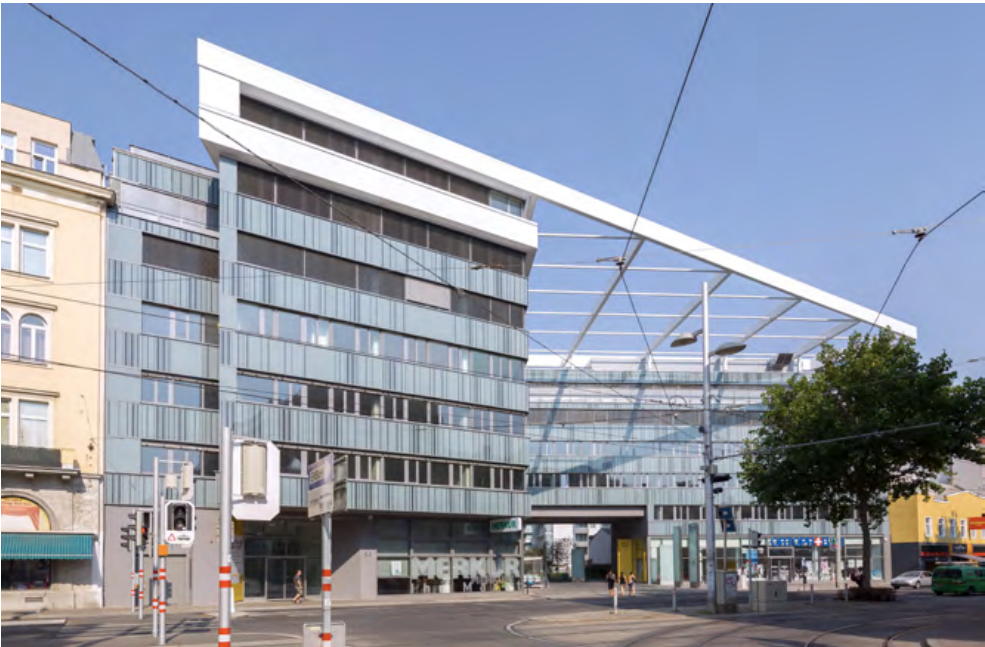
DOC Eleven, 1110 Vienna