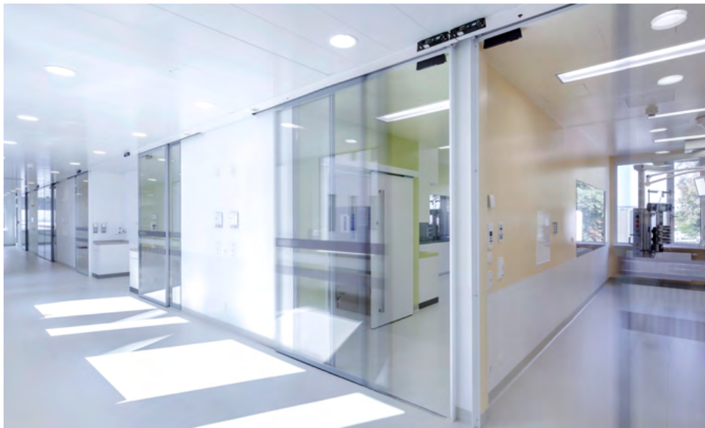
Kaiser Franz Josef Spital (Favoriten Hospital), 4. Med., 1100 Vienna

With expertise and innovation, we create complex medical space solutions.