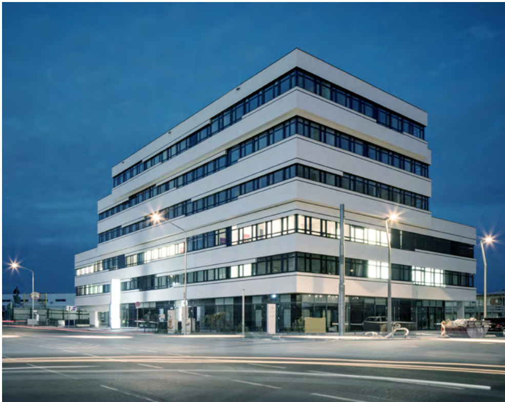
MED22, 1220 Vienna