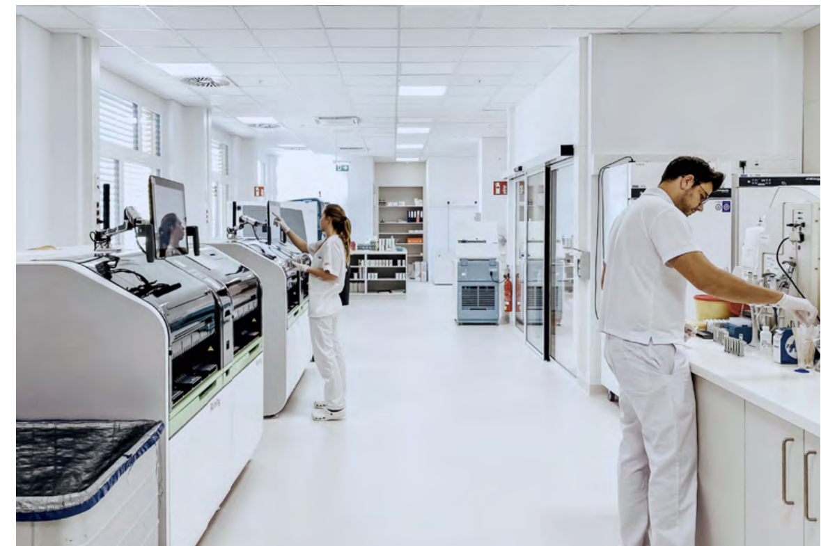
LABCON - Medical Laboratories GmbH, 1100 Vienna

Different demands, specific technology and regulatory requirements: We plan your individual laboratory and support you in matters of workflow, regulatory requirements, laboratory technology, equipment, clean room, etc.