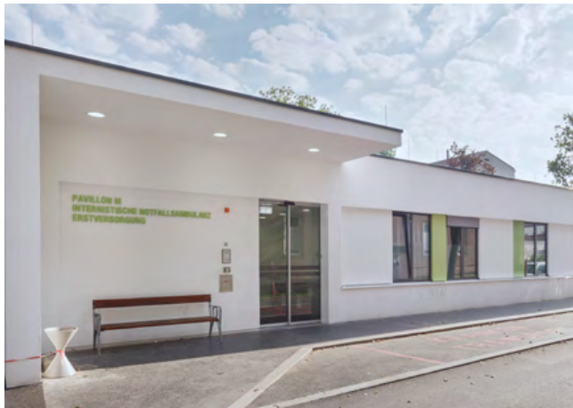
KFJ Pavilion M Emergency Room, Internal Medicine First Aid, 1100 Vienna

Individual wishes and future development – urbanization, demographic change, digitization, climate change – are influencing our planning.