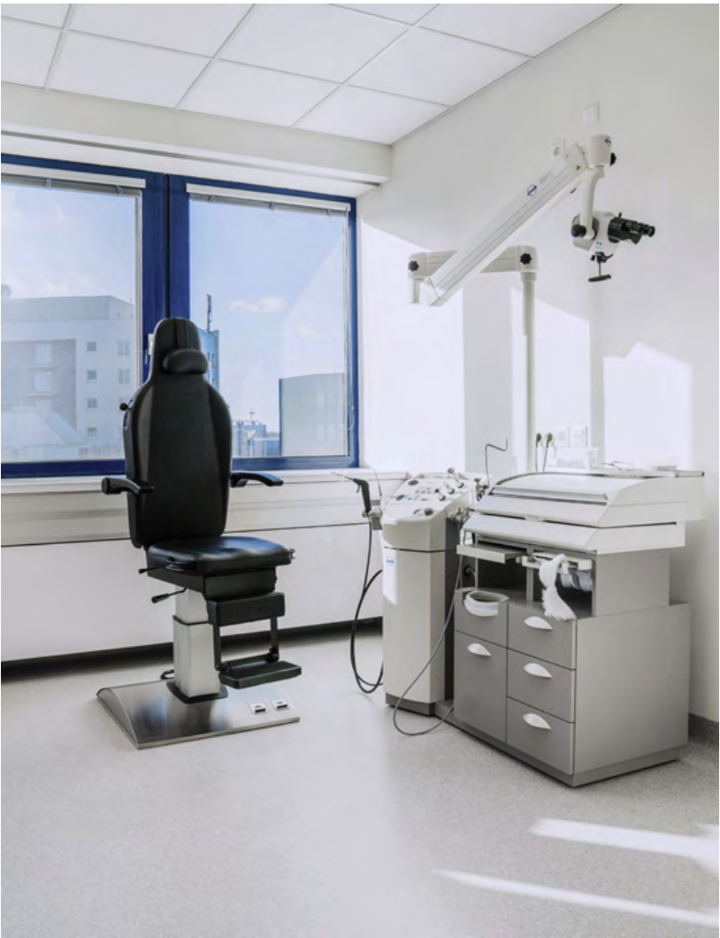
Health Center Vienna Airport 1300 Vienna