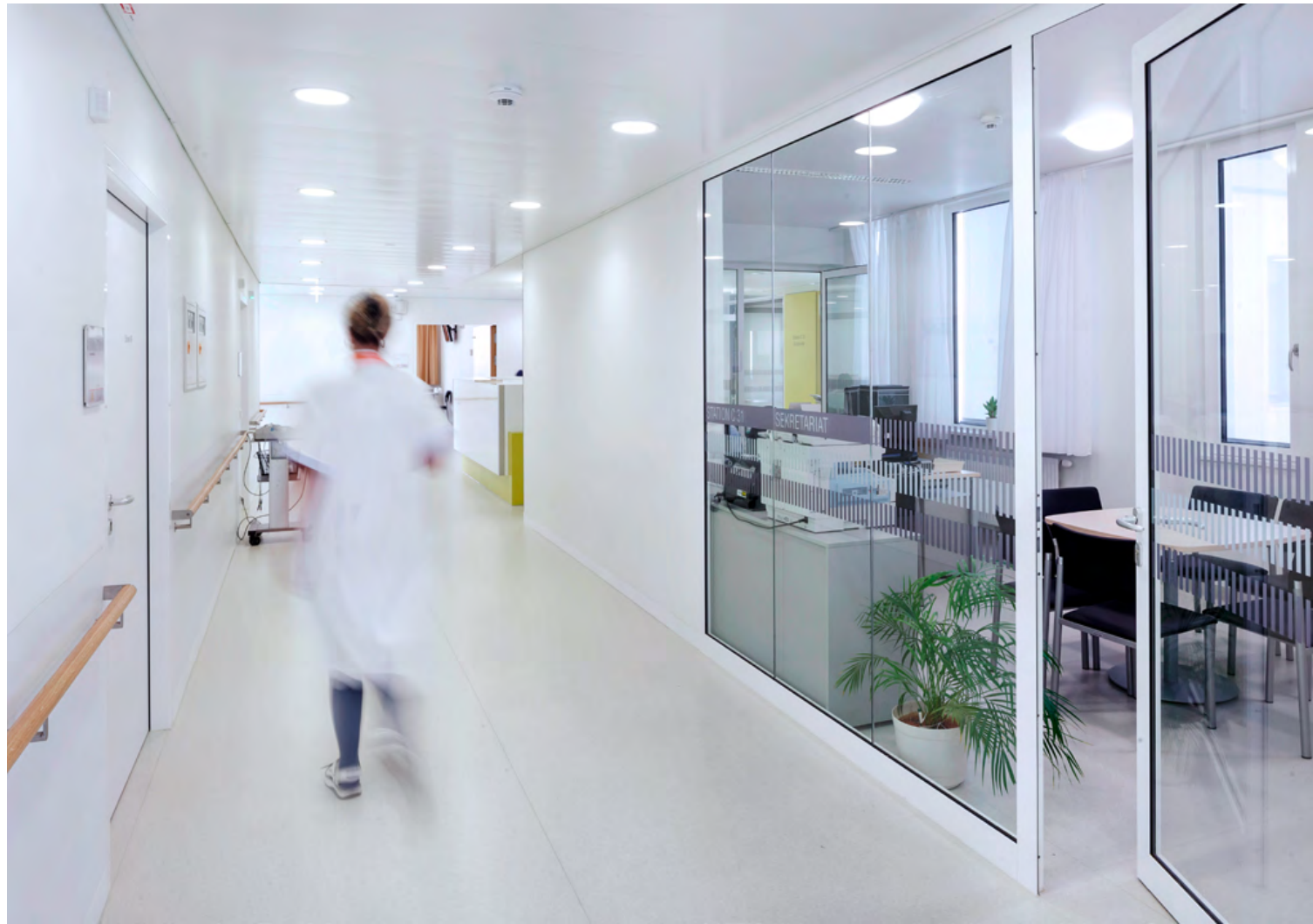
Provisional Modular Building, Kaiser Franz Josef Spital (Favoriten Hospital), 1100 Vienna