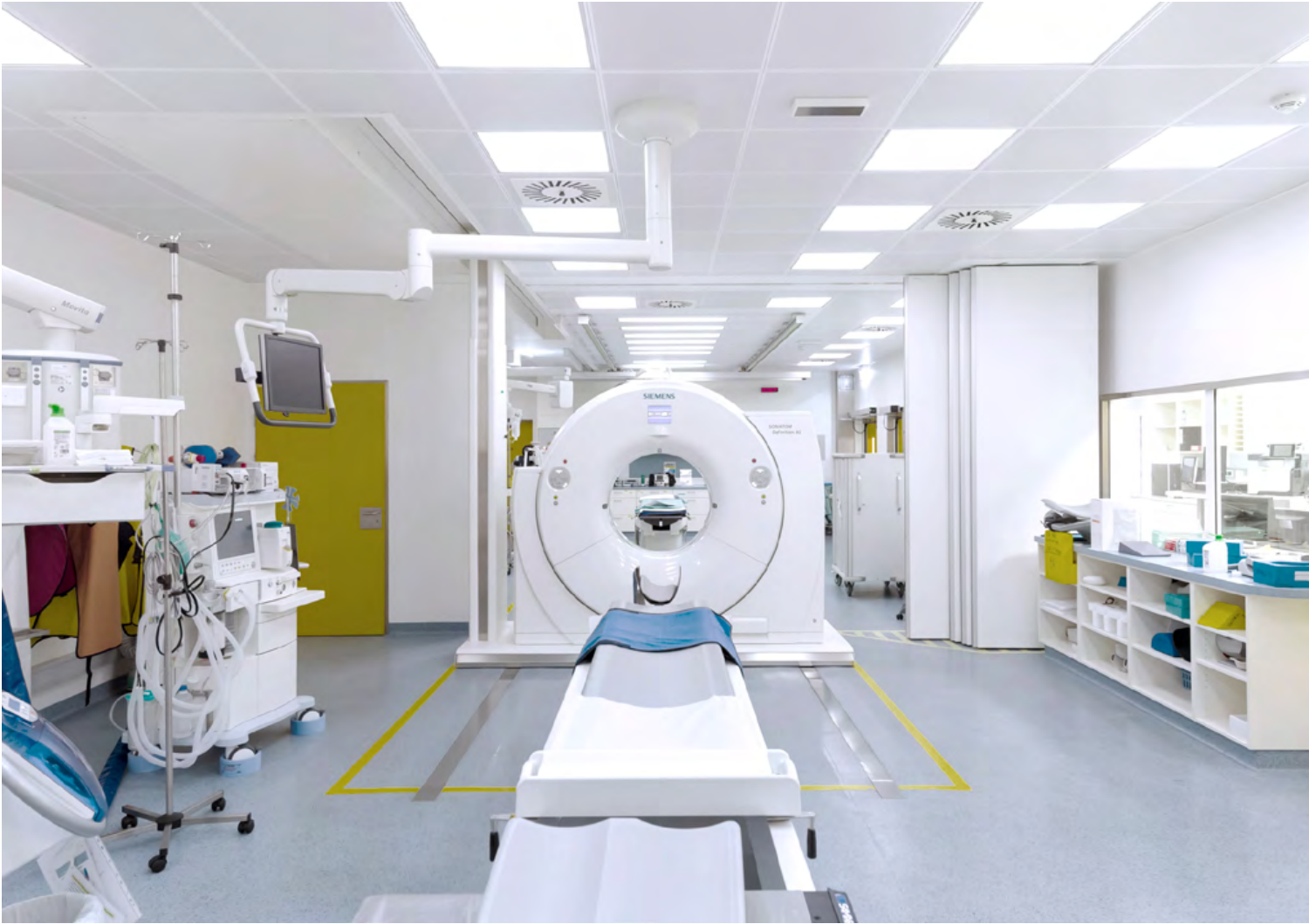
Schockraum Wilhelminenspital, 1160 Wien