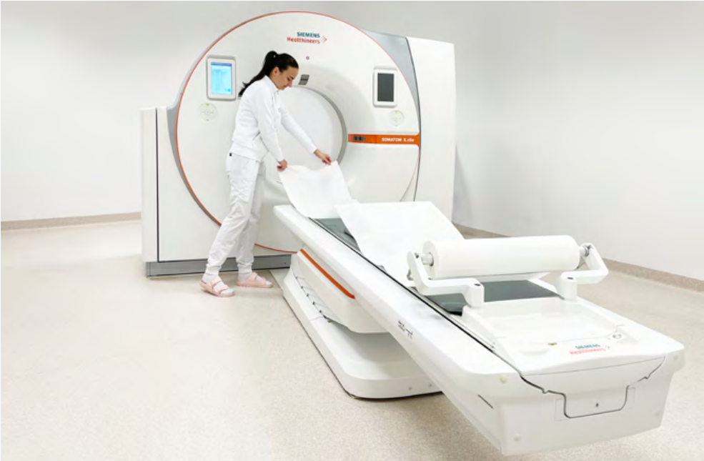
Institute for CT MRI, 2230 Gänserndorf