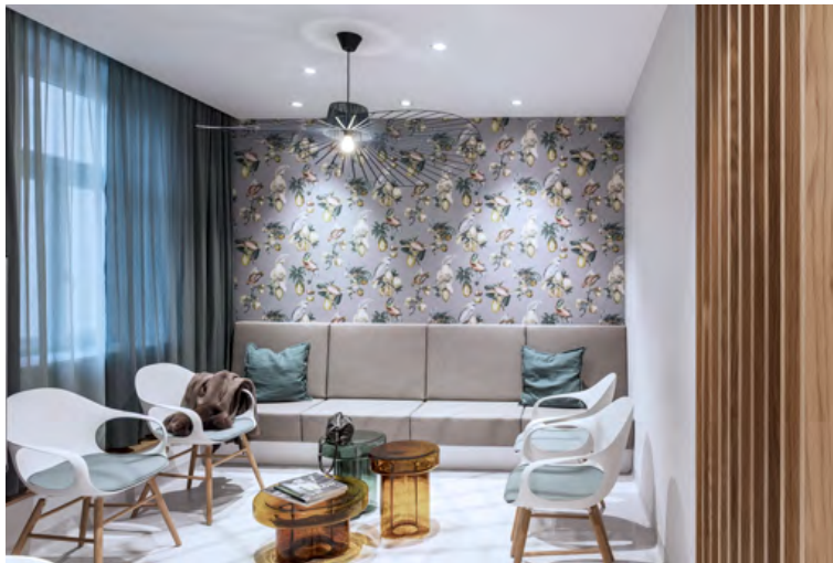
Ärztzentrum Paulus 12, 1120 Vienna

Optimal practice space has a strengthening effect: your new practice conveys trust and security and promotes a positive experience.