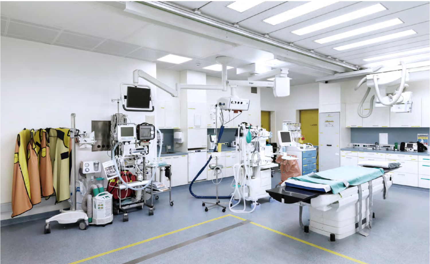
Trauma Room, Ottakring Hospital (Wilhelminenspital), 1160 Wien

Safety in exceptional situations. Holistic medicine requires total solutions. As constructor and operator, we assume responsibility for the entire lifecycle of your healthcare facility: modern, with the highest workplace quality and function according to the latest hygiene and safety standards.