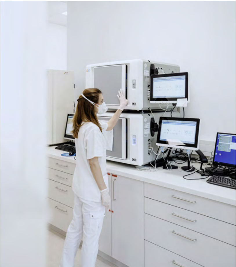
LABCON - Medical Laboratories GmbH 1100 Vienna